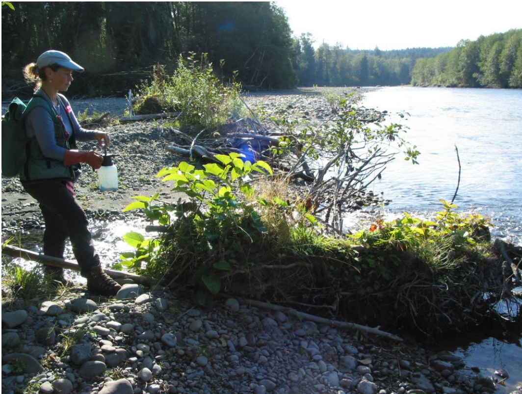
Large rhizome resprouting at Elk Creek side channel confluence with the mainstem Hoh River.