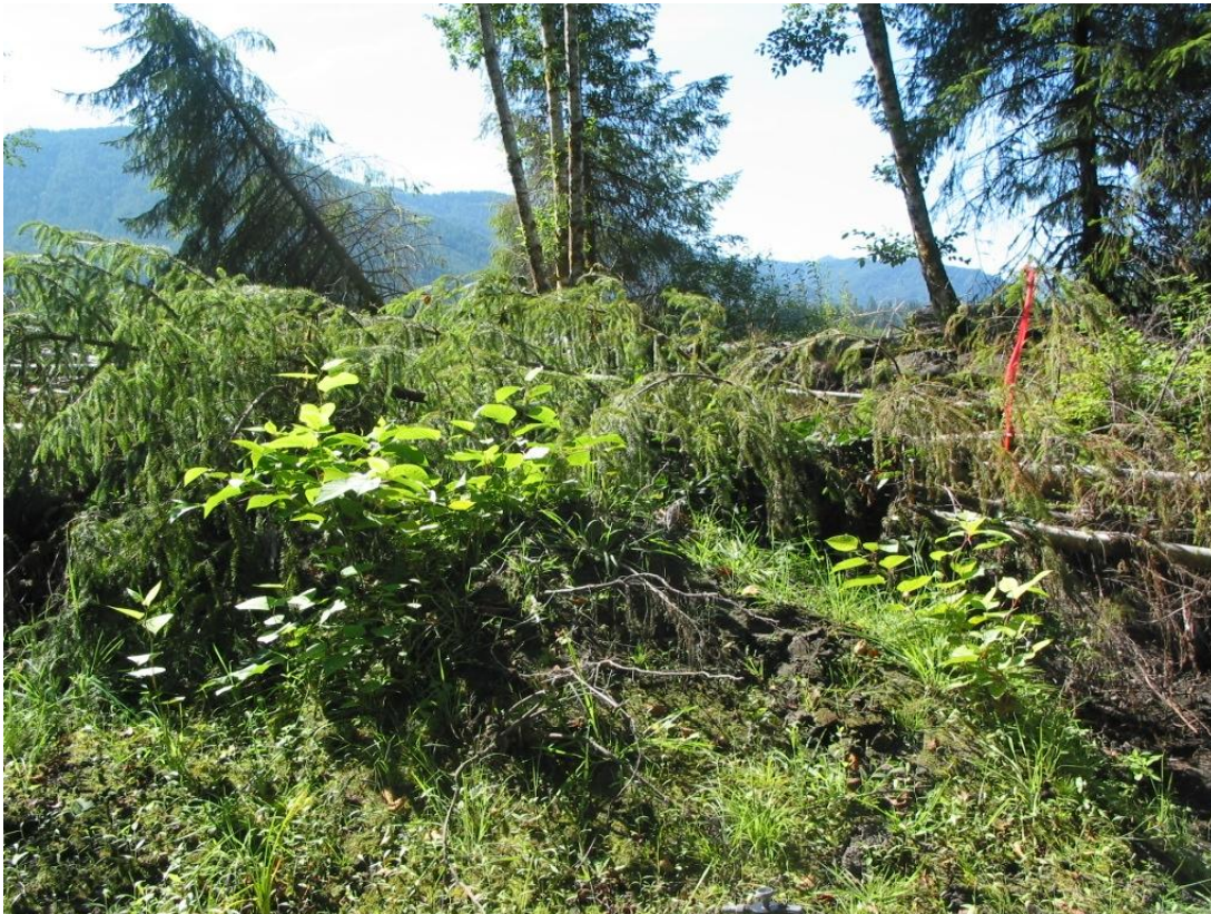
Re-sprouting clump in downed wood and scoured terrace deposits at Canyon Creek.