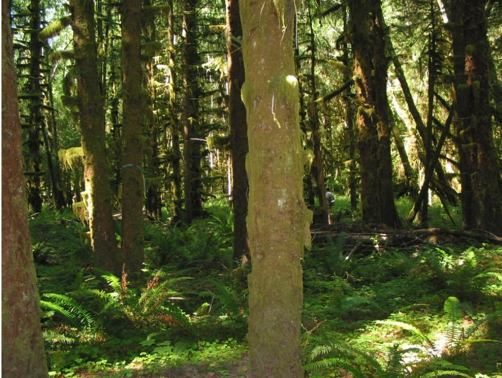
A treated site from 2008 with no re-sprouts and healthy native plants – as shown by old blue and yellow flagging on the spruce bole, third over from the left.