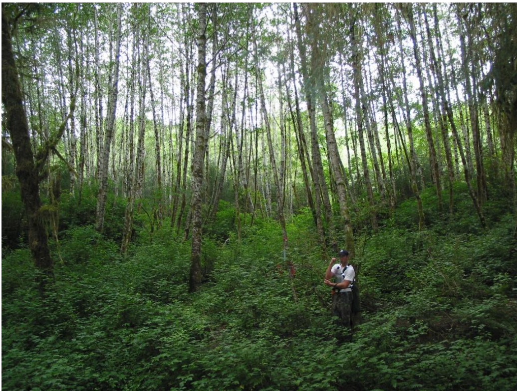
Chase in a salmonberry and alder flat with a new plant at an old plant site.