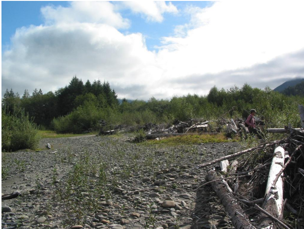
Examples of different survey challenges – Matt searching the edges and interiors of willow and alder thickets, open gravel bars, and log jams. Mature spruce forest patches are in the distance.