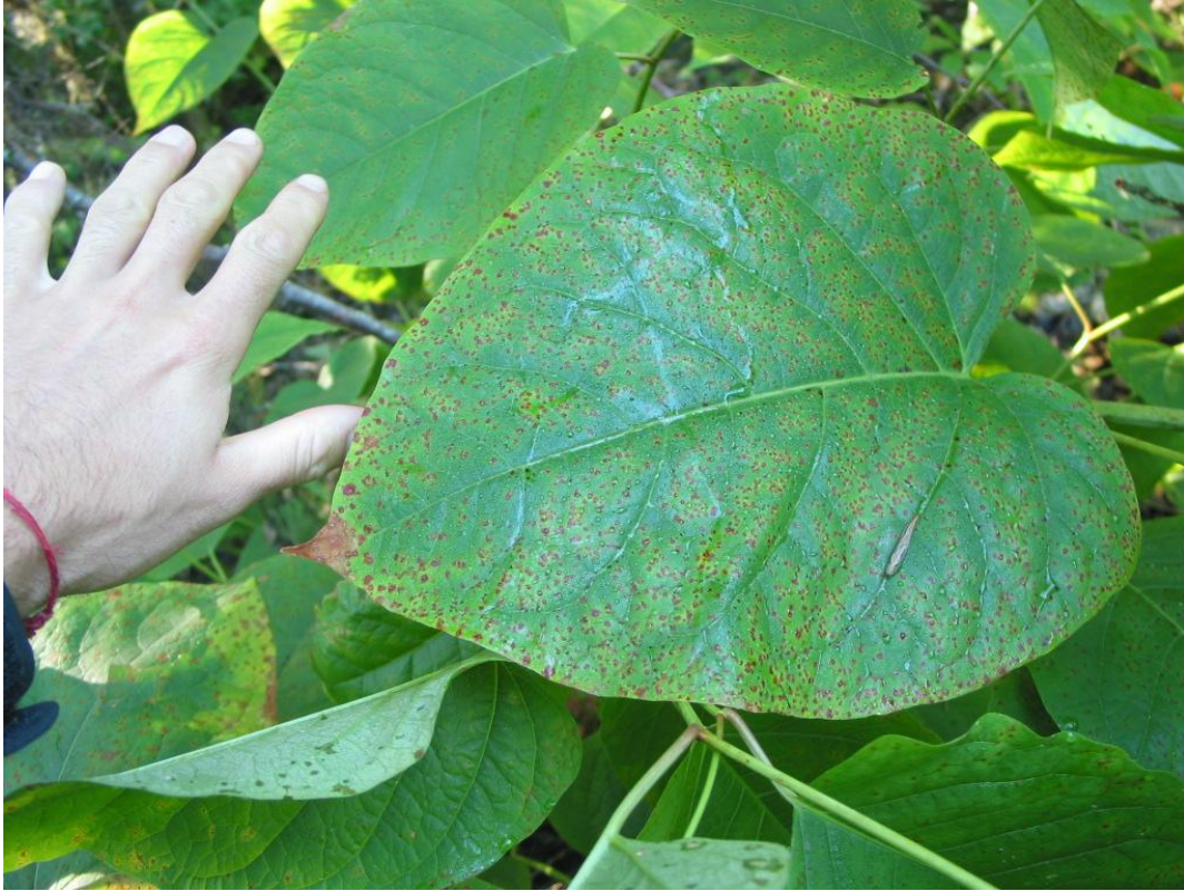
Possible giant knotweed between Owl and Maple Creeks.