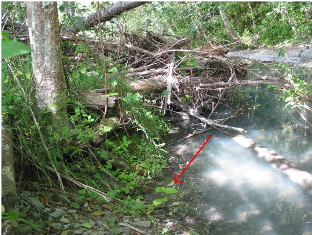
Small plant at edge of side channel at Lewis Channel (follow red arrow).