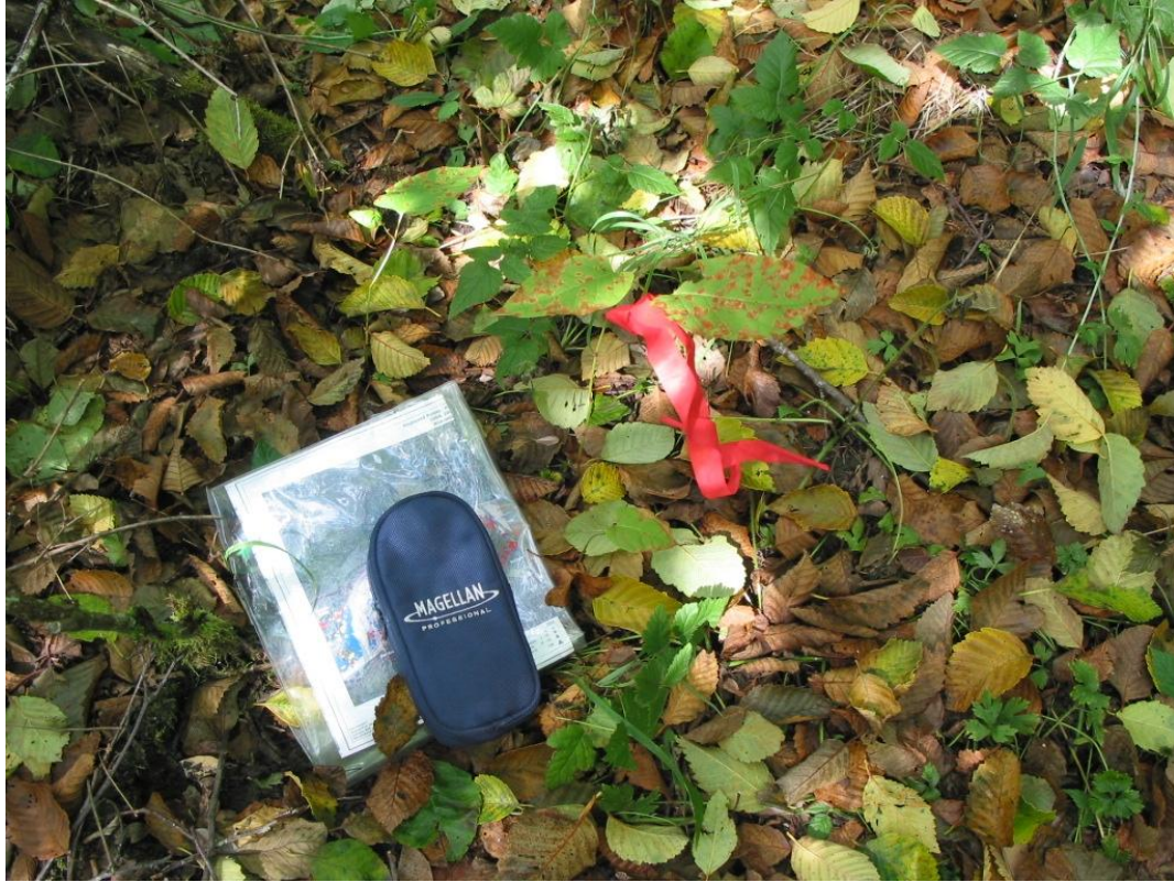
Tiny plant with spots.