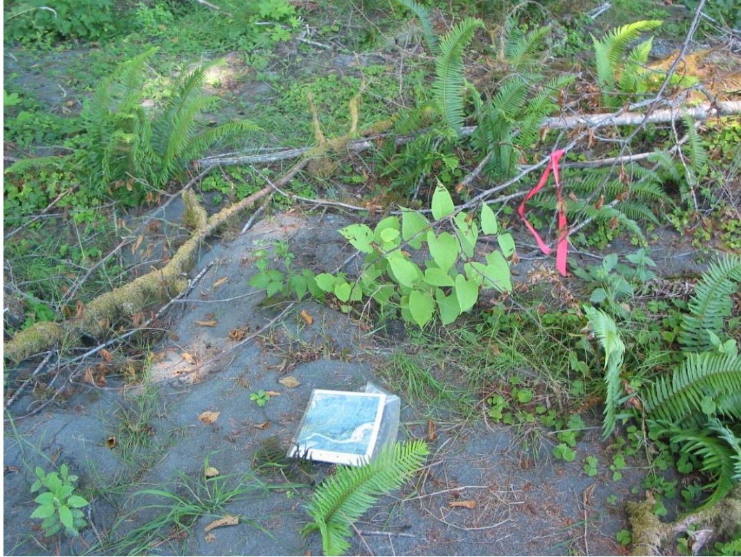
Plant in flood silt deposits along Spruce Creek bank.