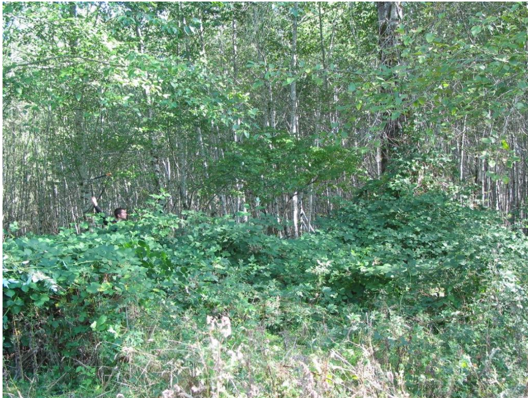
Himalayan blackberry clump at Richmond Island – Michael is holding loppers as high as the canes in the alder trees. This species impacts our ability to control knotweed.