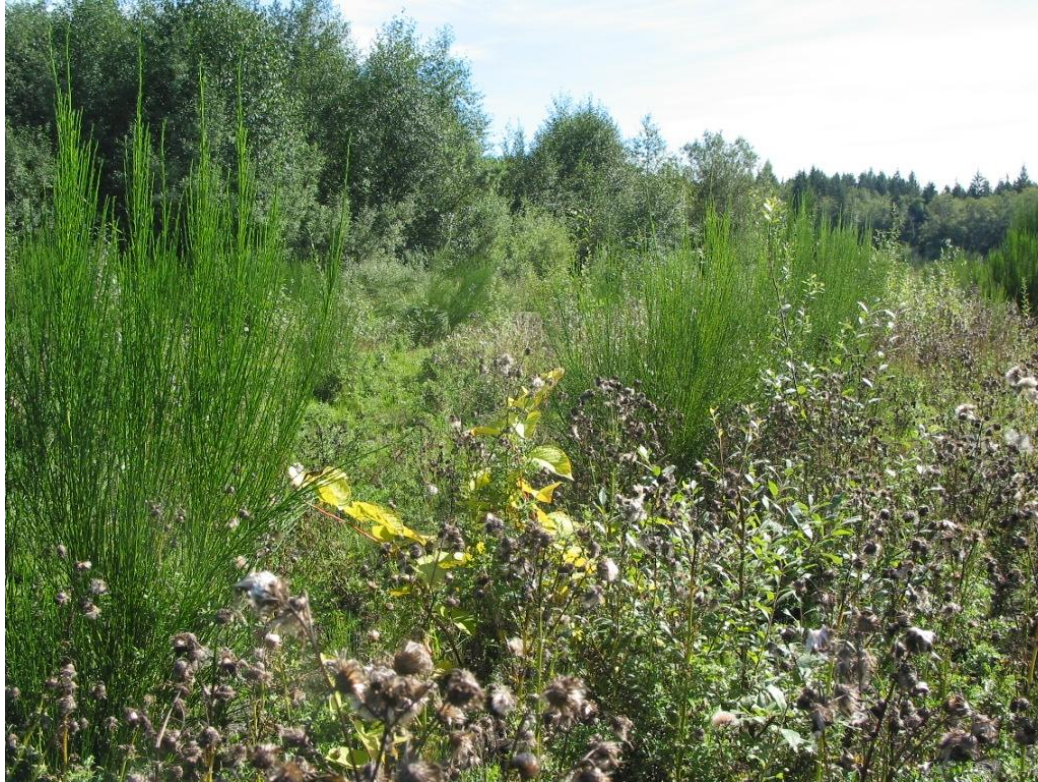
Scotch broom, Canada thistle, and knotweed established at Schmidt Bar.