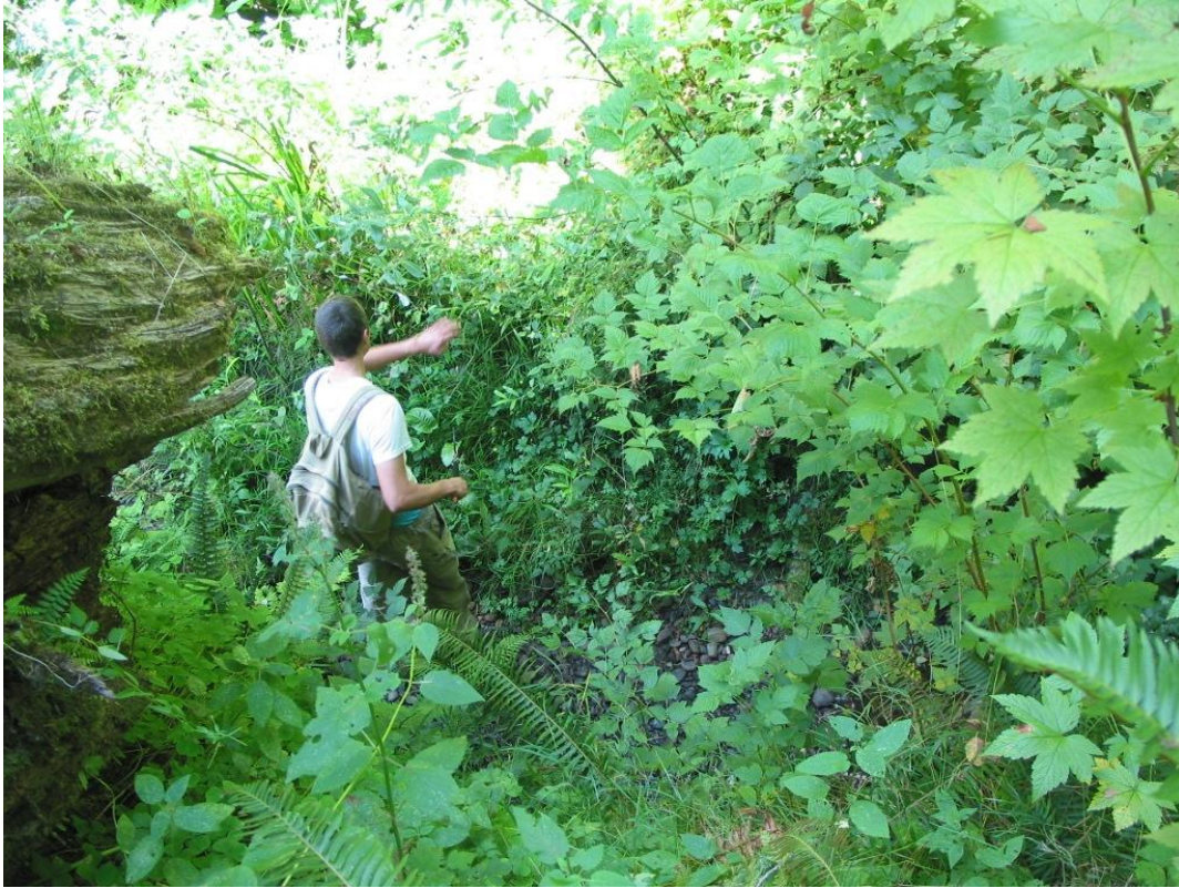
Michael seen from atop a log jam - searching through dense native shrubs is a challenge!