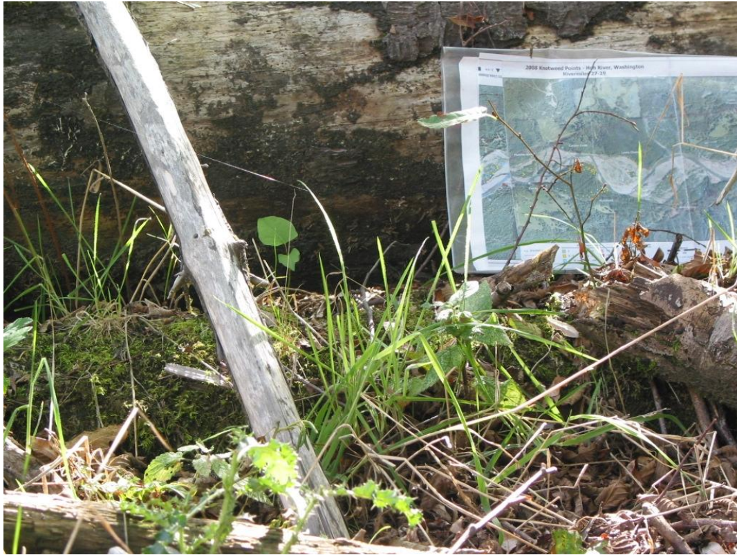
Single tiny plant at Brandeberry under a log in a log jam – down from 4108 in 2003.