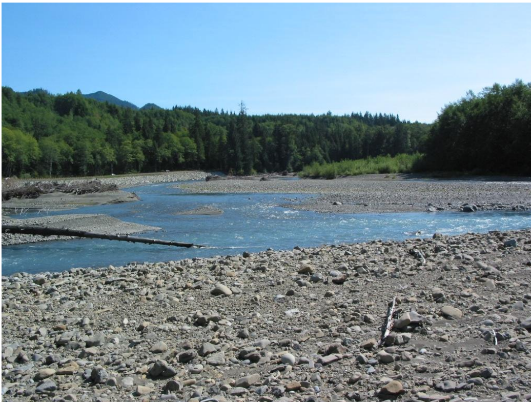
River disturbance zone at Tower Creek and east end of Morgans – new channels carved.