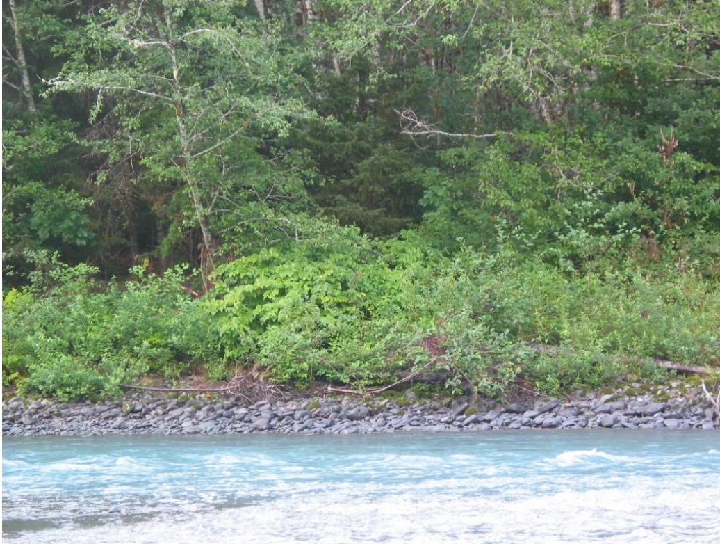
Large clump from above viewed from Spruce Canyon across the river.