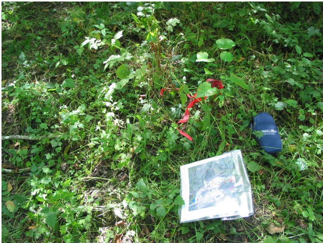
Small plant (with red ribbon) in native forb layer with GPS unit and map for scale.